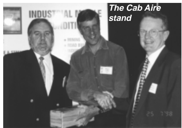
The Cab Aire stand